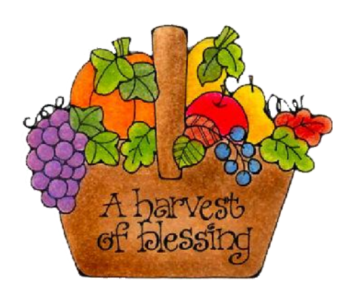
SCCQG Nancy Witt

For upcoming quilt shows, see calendar section at top of page 2.